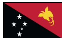
Papua New Guinea