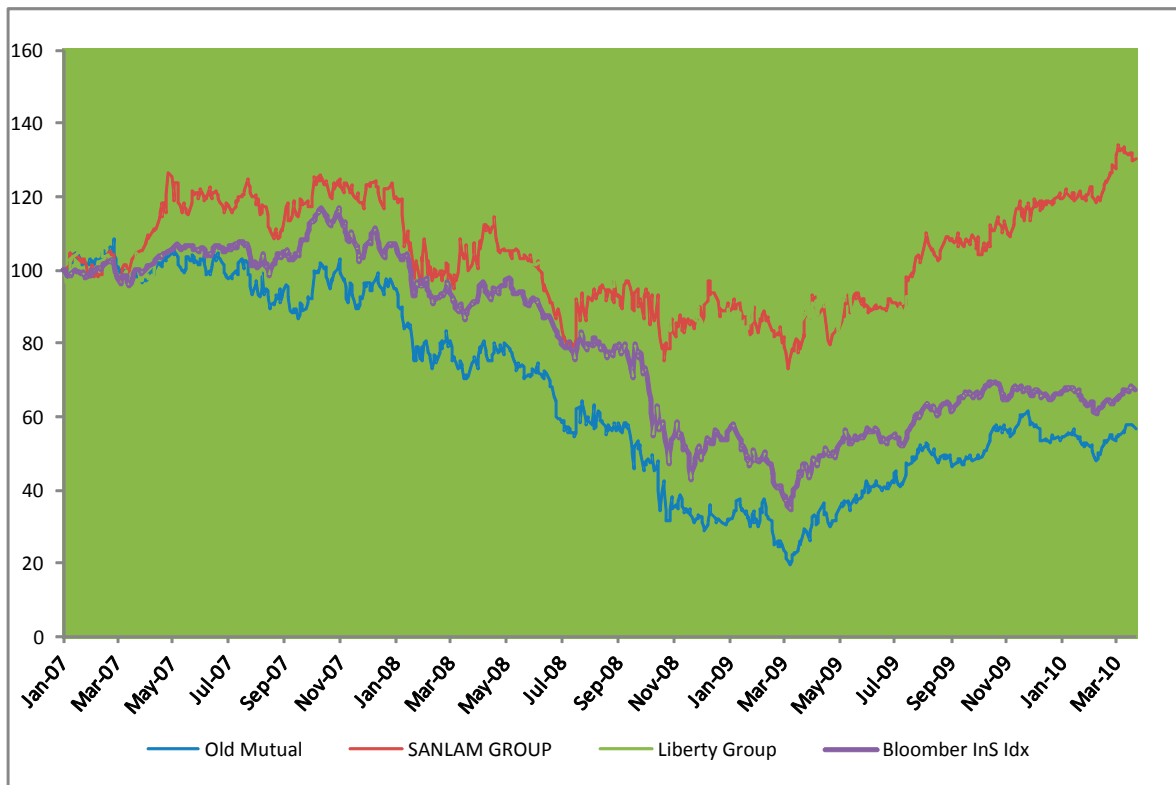
Figure 2. South Africa: Share Price Movements of Major Insurance Groups