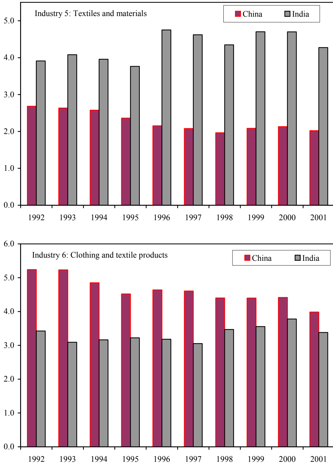
Figure 3. China and India: RCA, Industries 5 and 6, 1992–2001