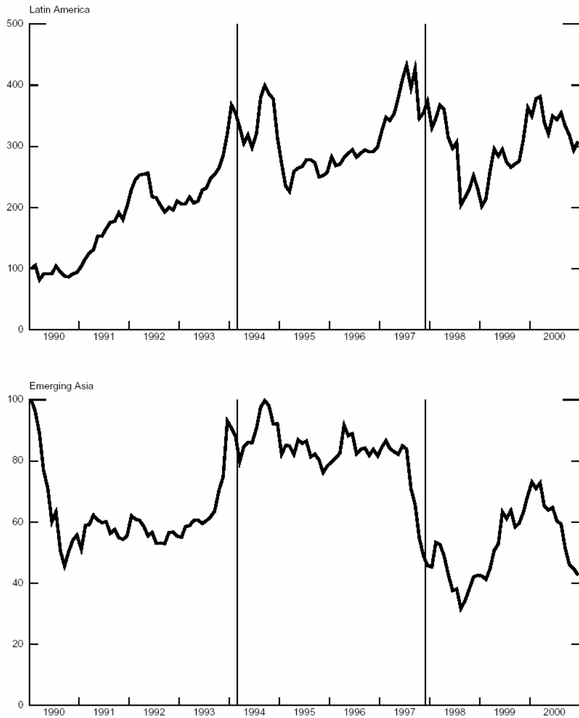
Figure 1. Equity Prices in Latin America and Emerging Asia, 1990–2000

Notes. Equity prices are from the S&P/IFC Global index (rescaled so that Jan. 1990=100). Vertical lines are at March 1994 and December 1997, the dates of the benchmark survey data.